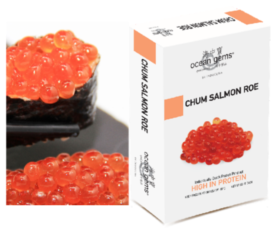
The Iturup Island Chum Salmon Fishery is MSC Certified Sustainable fishery